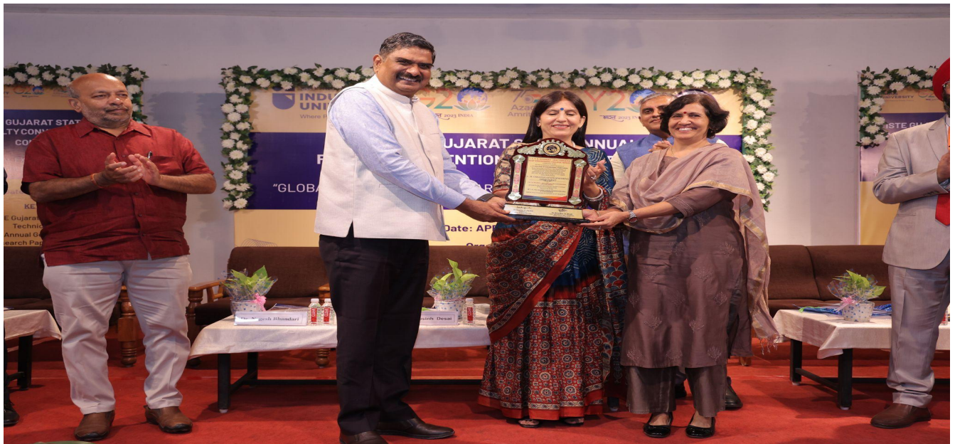
ISTE Guj.- UKA Tarsadia Best Engineering College Award to L.D. College of Engineering, Ahmedabad