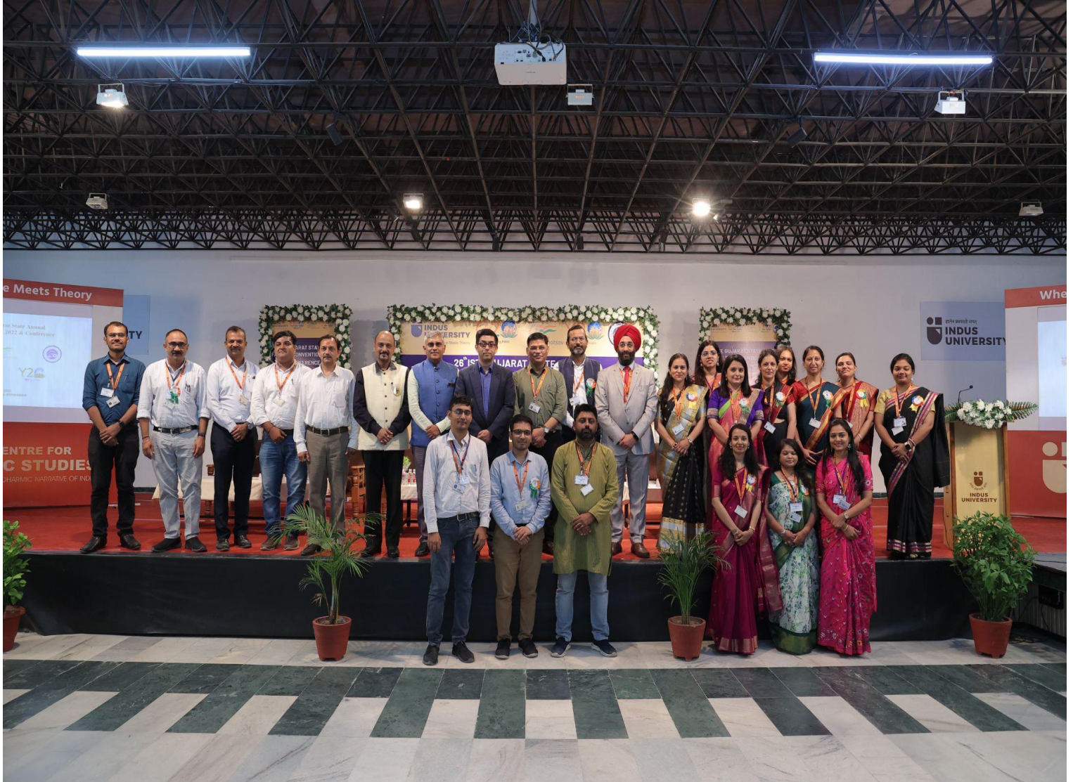
Group Photo with Organizing Committee