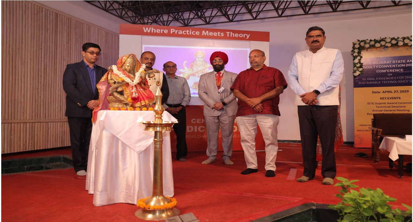
Lamp Lighting by the Dignitaries