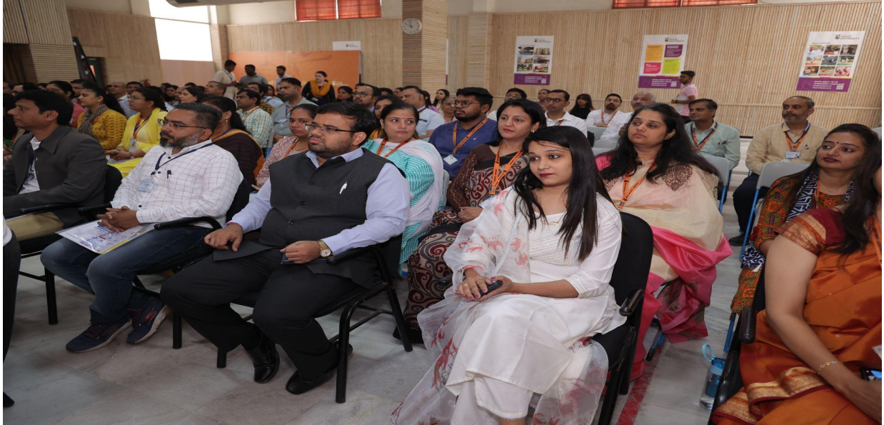
The Participants & Awardees of the Event (Indus University, Auditorium)