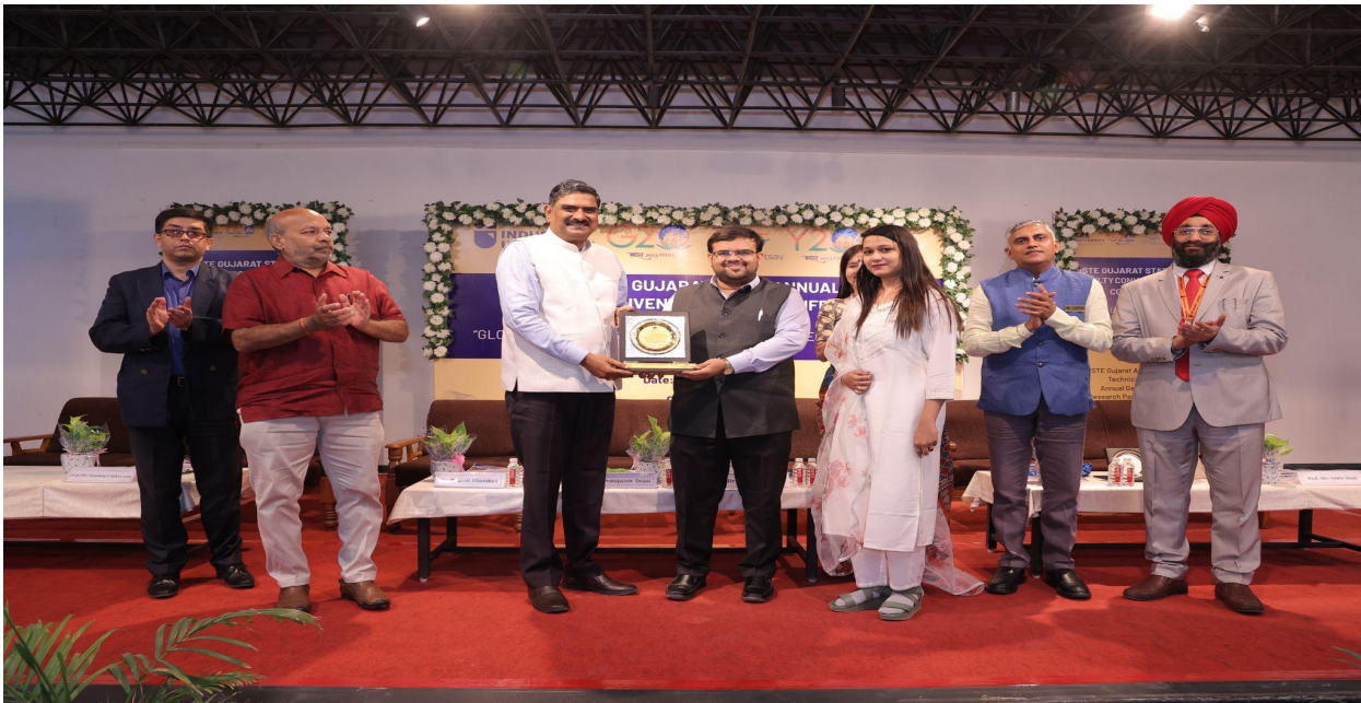
Most Promising ISTE Chapter Award to SAL Institute of Technology & Engineering Research, Ahmedabad