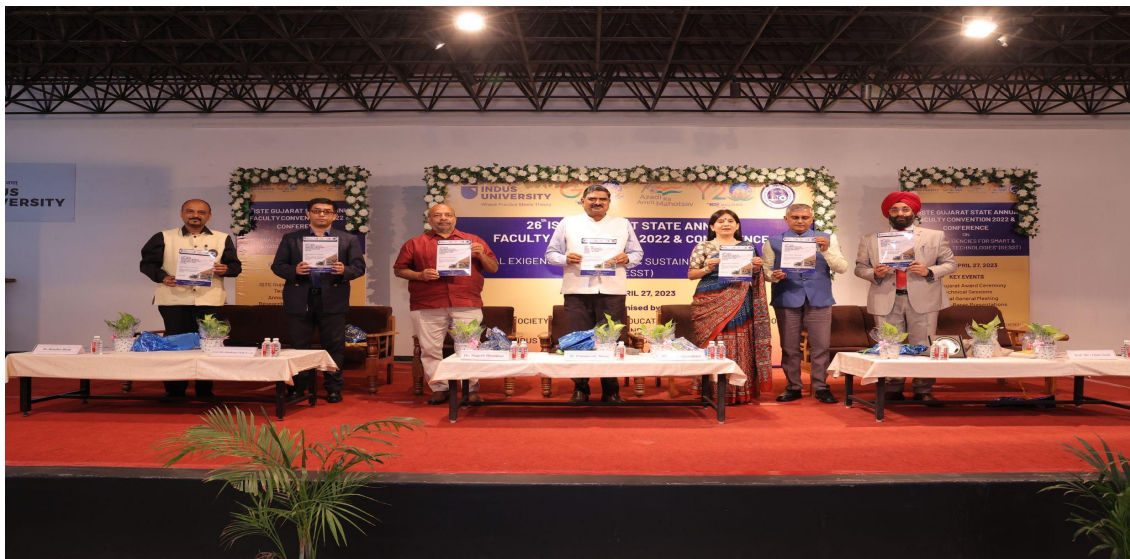
Release of Conference Proceedings by Dignitaries