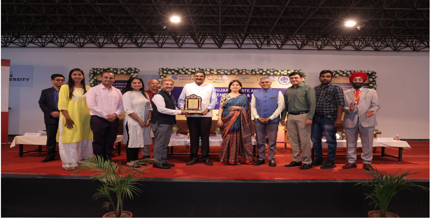
Runner Up ISTE Best Chapter Award (Second Position) to Pacific School of Engineering, Surat