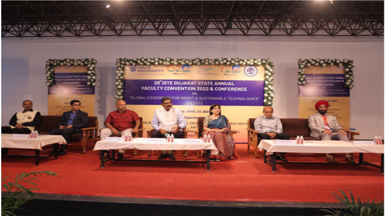
Dignitaries on the Stage