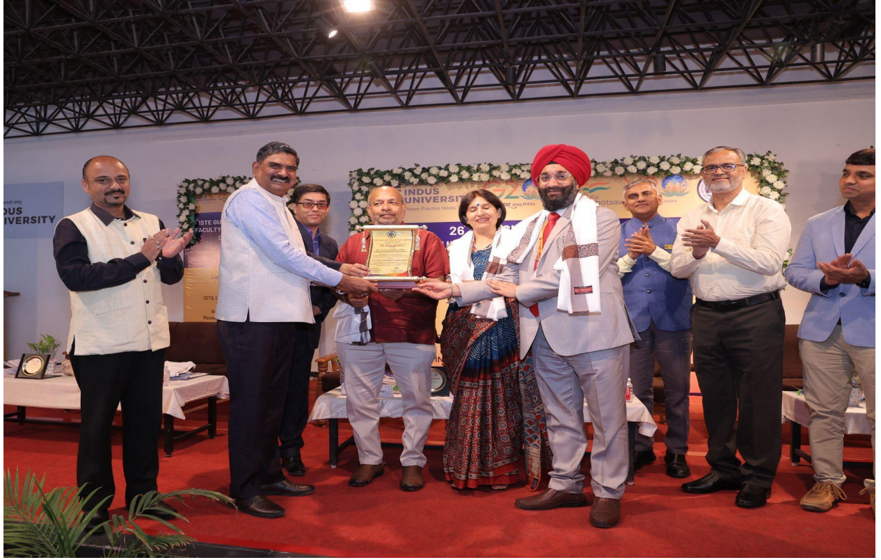
Special Appreciation Award to Indus University, Ahmedabad