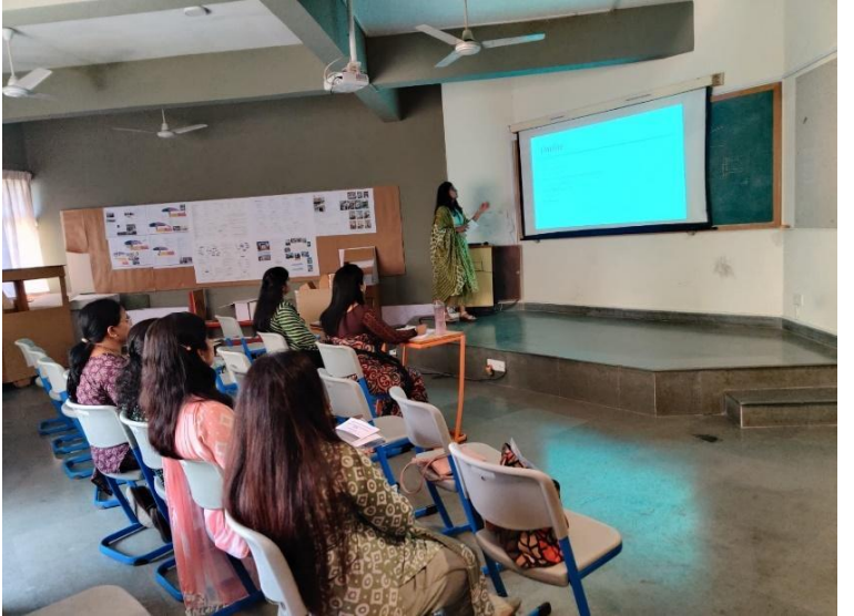
Research Paper Presentation by Participants in the Conference