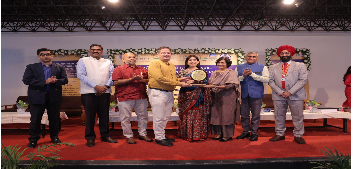
Institutional Member of Gujarat for Raising Highest Number of Life Membership Award to L.D. College of Engineering, Ahmedabad